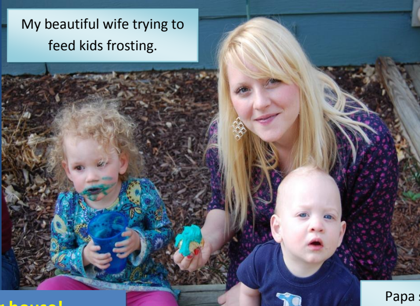
My beautiful wife trying to feed kids frosting.