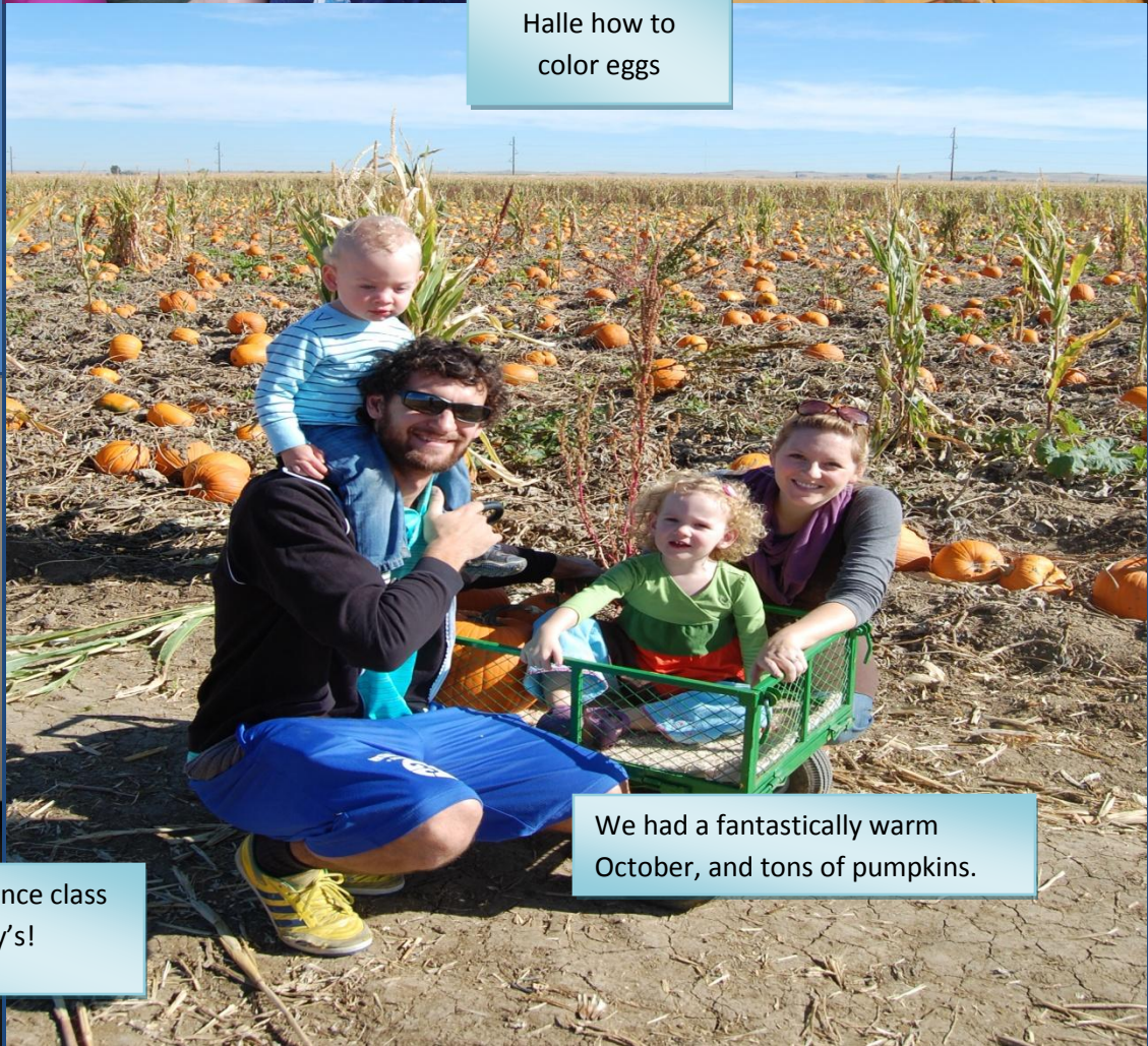
We had a fantastically warm October, and tons of pumpkins.